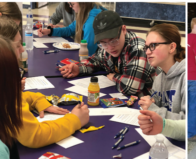
Stride™ a fast-paced youth-leadership conference for high-school students ages 15-18