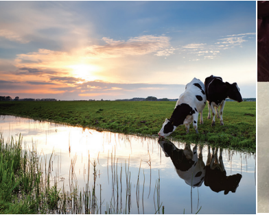
Environmental Initiatives forward-thinking people collaborating to protect our natural resources