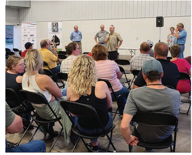
ACE Twilight Meetings® engaging all sectors of agriculture, community and government to enhance how we work together