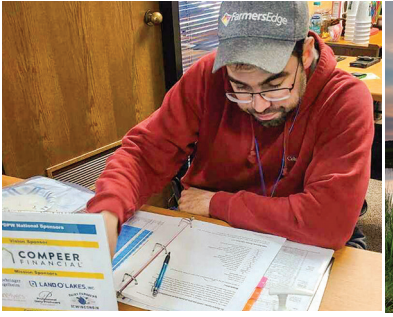
Financial Literacy for Dairy™ comprehensive, multi-level dairy-specific financial training; attendees seated by online placement test