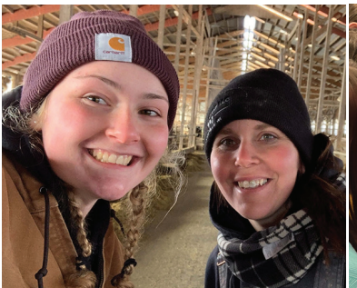
Mentor Program a job-shadow experience pairing college-age students with dairy producers