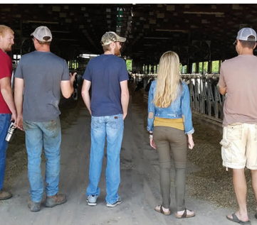
Peer Groups small groups of progressive, results-oriented dairy producers sharing solutions and ideas