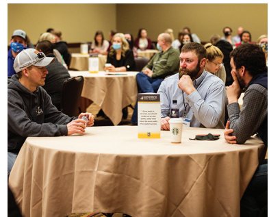
Cornerstone Dairy Academy™ a three-tier leadership development program for producers and industry