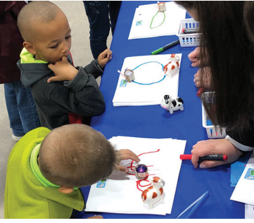
Grants generous donations from individuals and groups allow us to financially support dairy-related events and educational programming