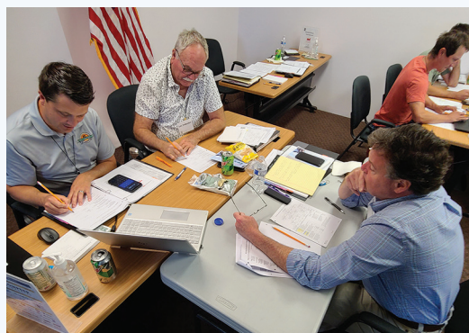
Financial Literacy for Dairy® level 3 participants working on advanced financial concepts to use in their businesses.