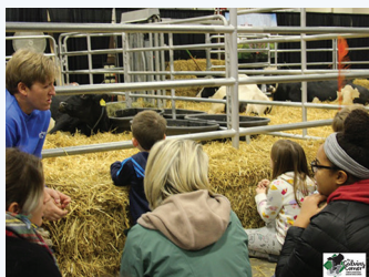
Children learning about a recent calf birth in the Calving Corner at the Pennsylvania Farm Show.

Our goal is to enhance the skills of current dairy producers and develop the leaders of tomorrow — all while strengthening and enriching the connection between consumers and producers.