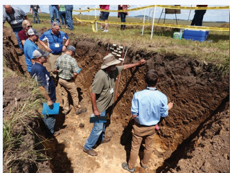
Participants at the Lafayette Ag Stewardship Alliance (LASA) water quality field day take measurements from within a soil pit.