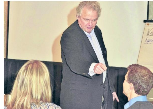
Professional Dairy Producers Foundation